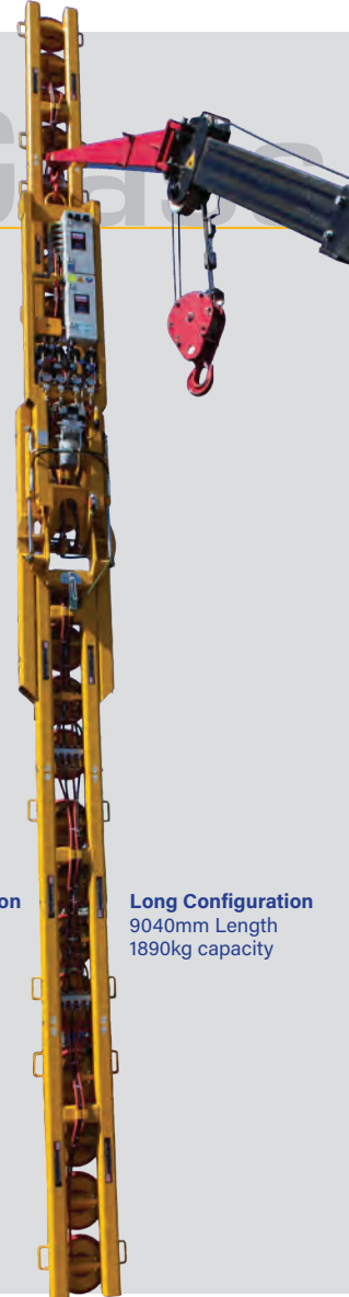
Long Configuration 9040mm Length 1890kg capacity