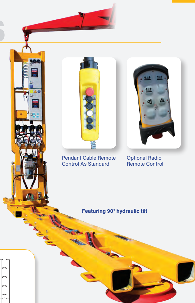
Featuring 90° hydraulic tilt