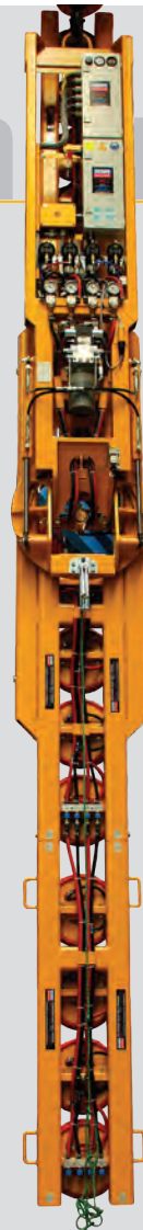
Medium Configuration 6040mm Length 1400kg capacity