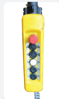
Pendant Cable Remote Control As Standard