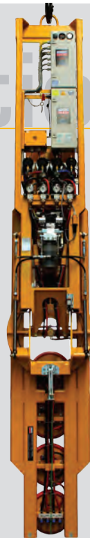
Short Configuration 3040mm Length 750kg capacity