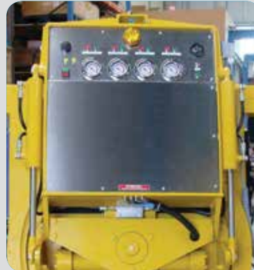
Control panel with quad-circuit vacuum and 90° twin hydraulic tilt cylinder system