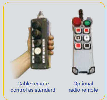
Cable remote control as standard