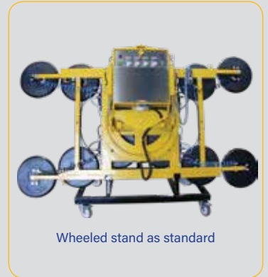
Wheeled stand as standard