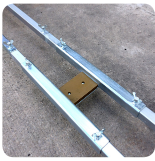
Easily breaks down into small parts for transport