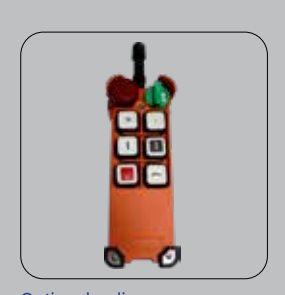
Optional radio remote control

* The capacity is 1000kg with extension arms and 14 pads fitted.