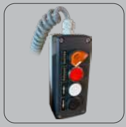
Cable remote control as standard