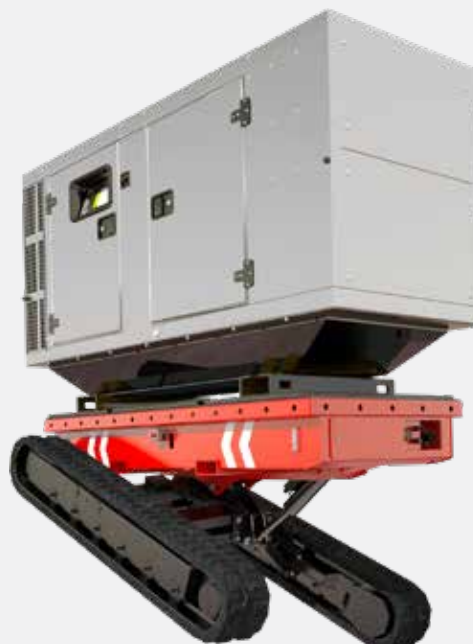
The Tracked Leveller can work on slopes up to 20° all while keeping the load level.