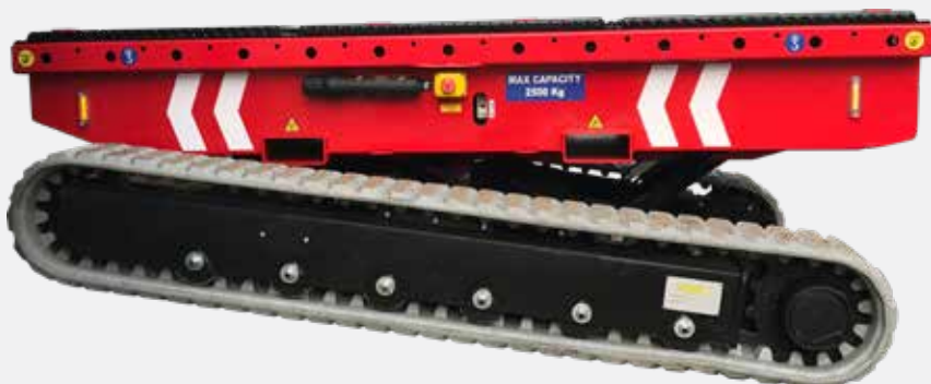
The Tracked Leveller features automatic dynamic self-levelling technology to ensure the stability of the load.