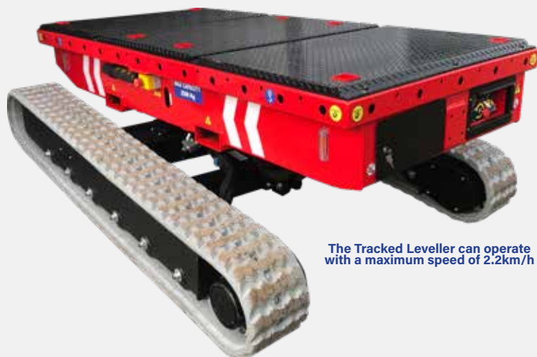
The Tracked Leveller can operate with a maximum speed of 2.2km/h