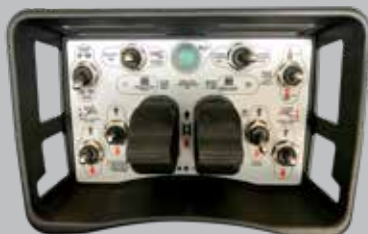
The Tracked Leveller is fully controlled by radio remote.