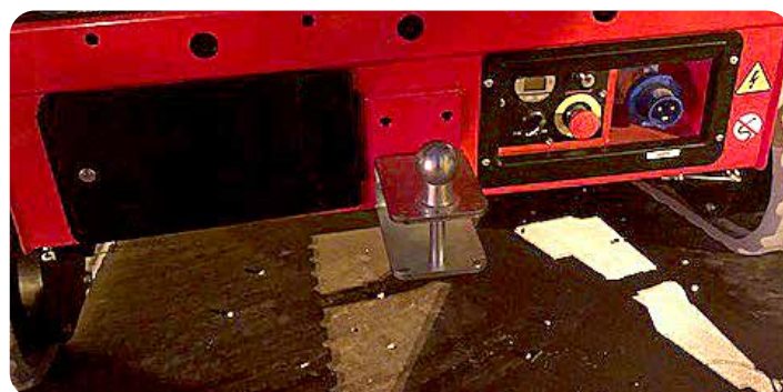
The Tracked Leveller features an optional tow bar accessory.