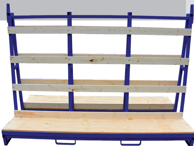
Glass Stillage with lifting eyes

Optional lifting eyes improve the versatility of the Glass Stillages to allow tower cranes, mobile cranes and spider cranes to be used in moving the stillage.