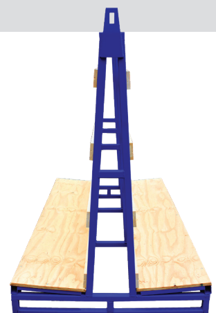
Glass Stillage with lifting eyes