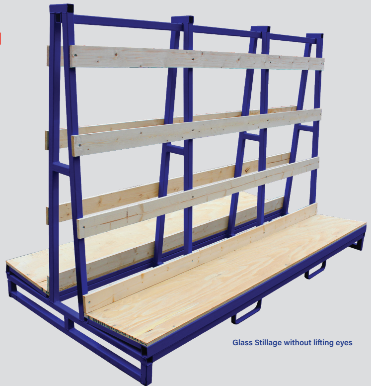
Glass Stillage without lifting eyes