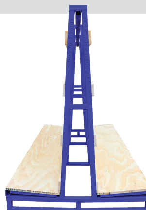
Glass Stillage without lifting eyes