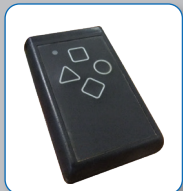
Optional radio remote control