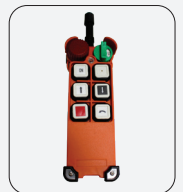
Optional radio remote control