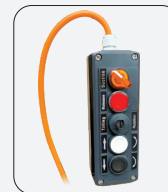
Cable remote control as standard