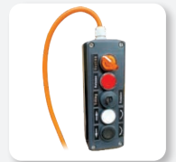
Cable remote control comes as standard