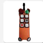
Optional radio remote