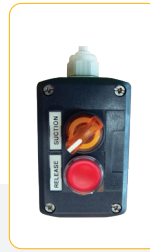
Cable remote control as standard