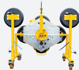
The DSKZL2 comes as standard with it's own transport stand.