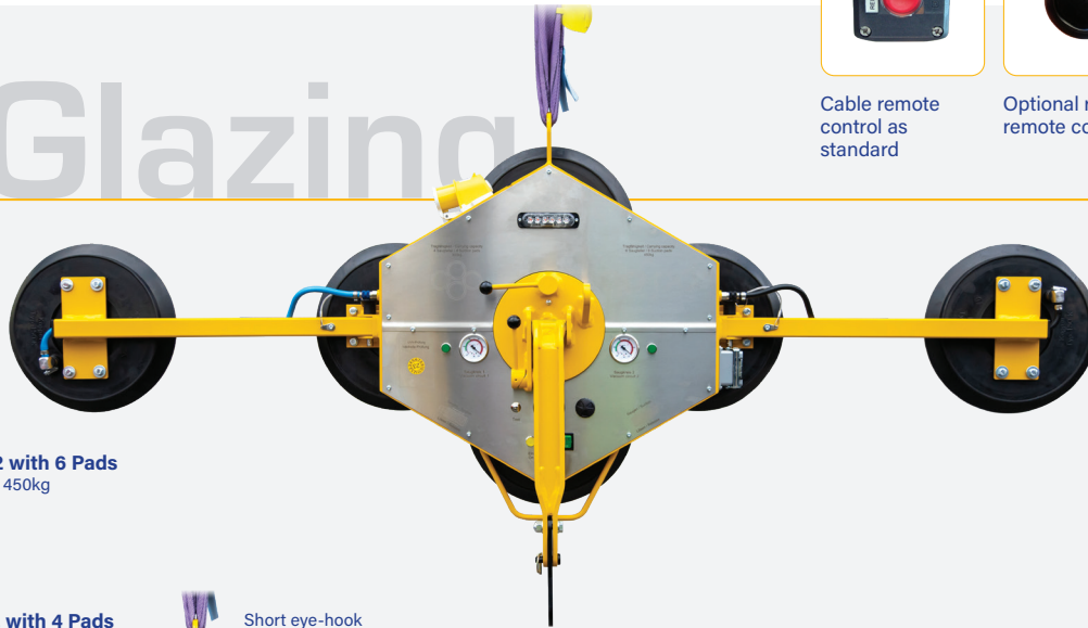
DSKZL2 with 6 Pads Capacity: 450kg