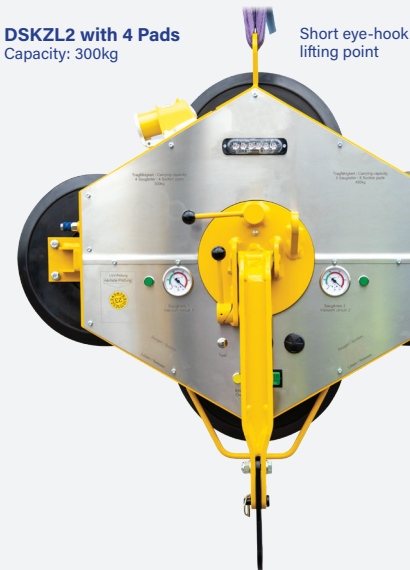
DSKZL2 with 4 Pads Capacity: 300kg