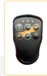
Optional radio remote control