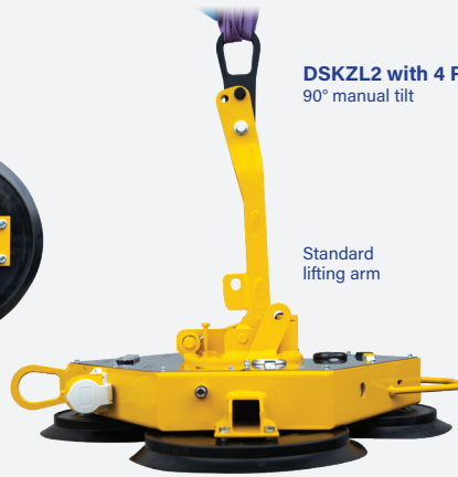
DSKZL2 with 4 Pads 90° manual tilt