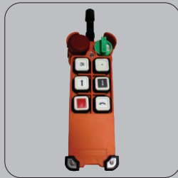
Optional radio remote control