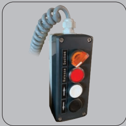
Cable remote control as standard