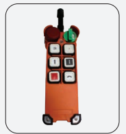
Optional radio remote control