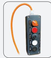
Cable remote control as standard