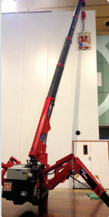
Reference Codes Mini-Clad - VCL09