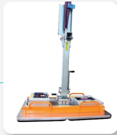
Manual 90° tilt