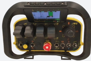
The MC32S is fully controlled by radio remote with digital feedback display