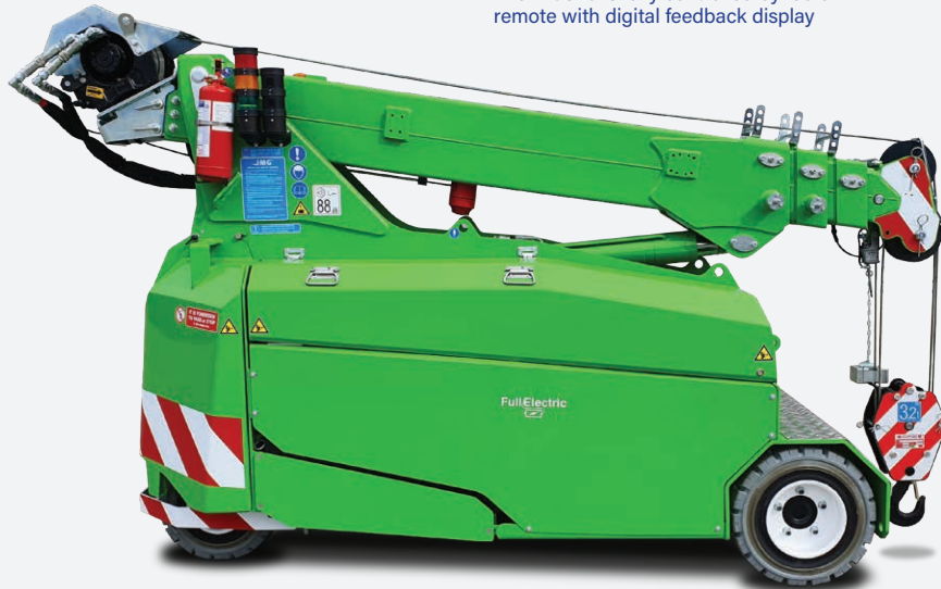
Shown with optional hydraulic winch