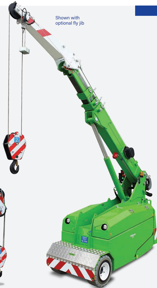
Shown with optional fly jib