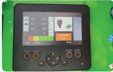
The MC32S comes with a built-in SLI to aid operators on-site