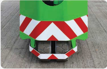
Optional non-marking tyres are available for the MC32S