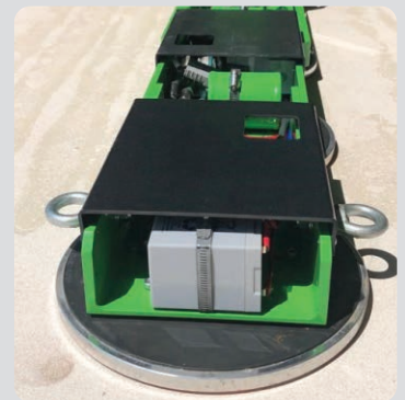
Reference Code VSL15