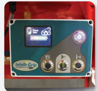
The Intelli-Grip technology monitors vacuum lifters in real-time.