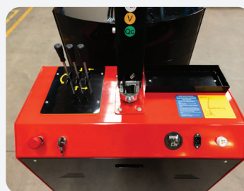
The Slewboy 500 Battery with its clean layout of controls gives operators an easy to use way to complete lifts safely and quickly.