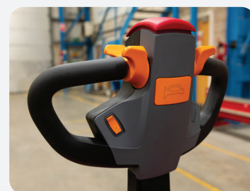
The tiller of the Slewboy 500 Battery is used to manoeuvre the machine around site and includes a body-bump safety button.