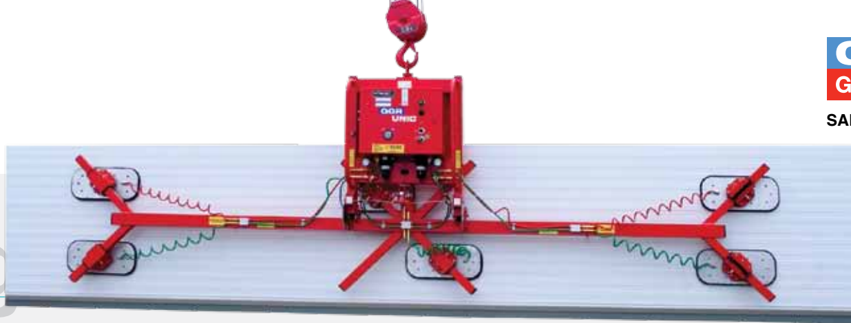
Optional slim pads